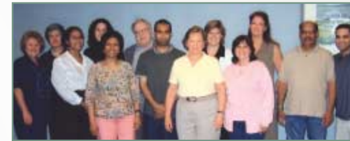
Youth Justice Committee volunteers working together to build safer communities.