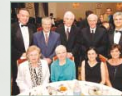
A Night at the Venetian (2004)